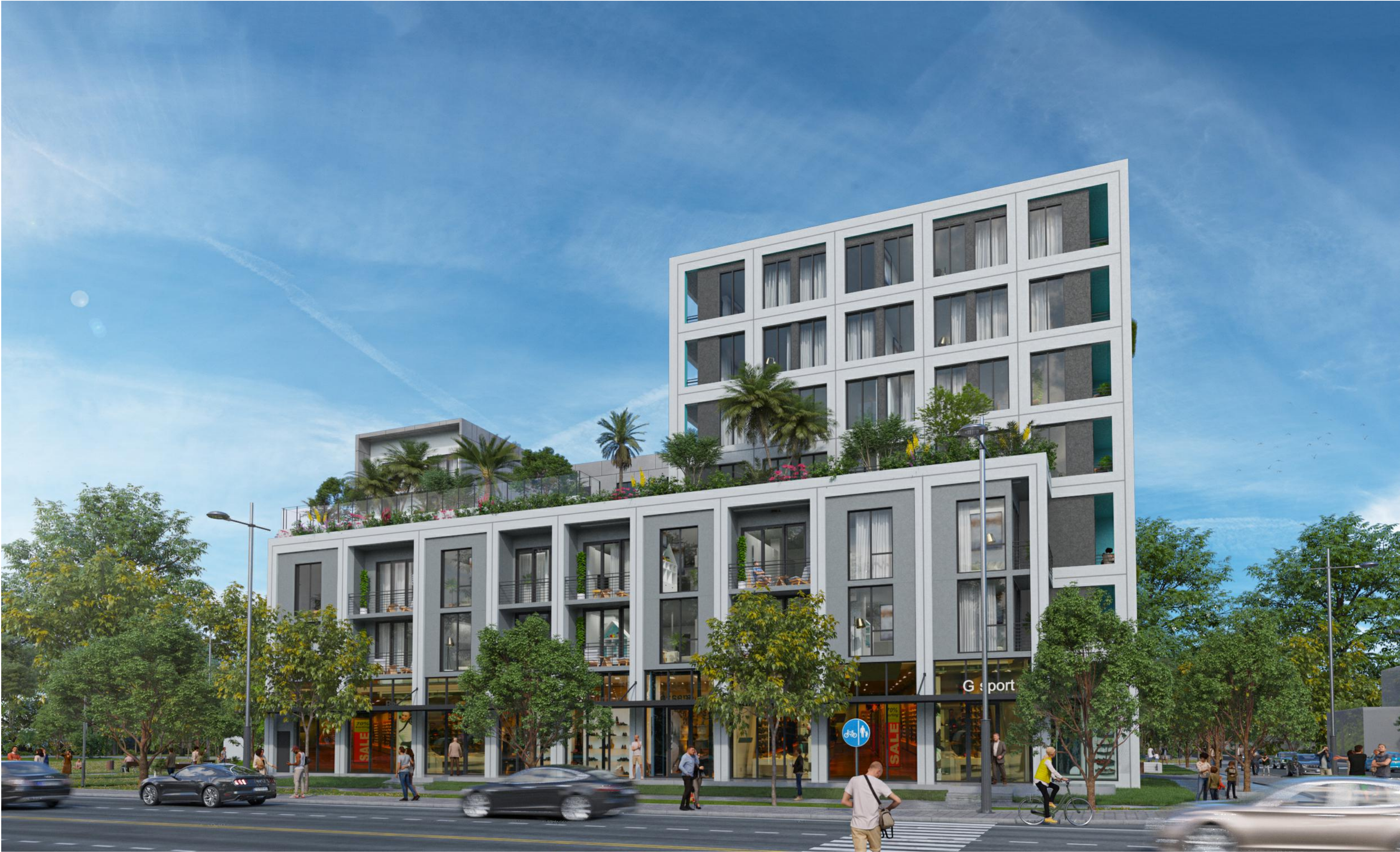
3D RENDERING -WEST VIEW (FRONTING FEDERAL HIGHWAY)